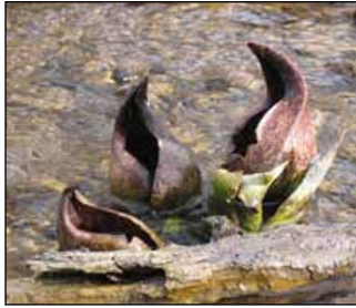
Skunk cabbage in March

It's March and our earliest wildflowers are in bloom! Hike out to the fen at Big Rock Forest Preserve and see the finest display of skunk cabbage in Kane County. Take the trail over the big bridge and walk the path into the woods. Take the left fork. You'll pass a sign telling you about the wetland and walk up a slight ridge. Look down, and you'll see lots of skunk cabbage plants. Skunk cabbage is the first flower to sprout and bloom in Kane County, sometimes even poking through the snow!