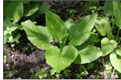
Skunk cabbage in late spring